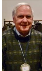
Circle of Service