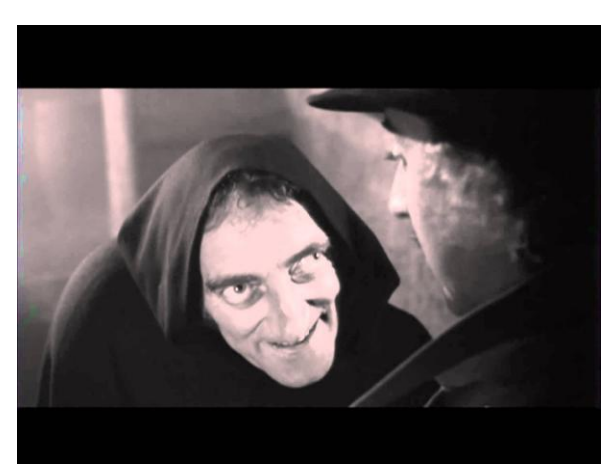
(Another Old One, but always worth a repeat...)

Honors: Bryn Mawr Book Award, Nomination for Outstanding Technical Leadership in the MN State Spotlight Theater Company, and varsity letter for Drama three years in a row.